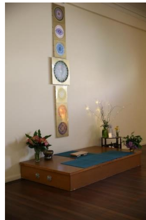
Main Hall teachers stage