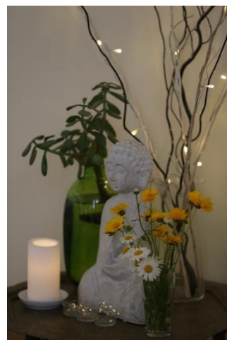
Main Hall altar