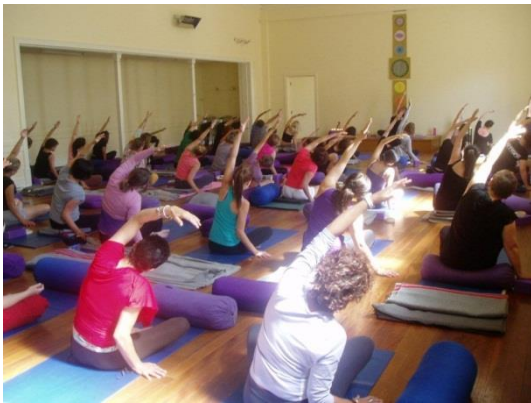
Full class in Main Hall