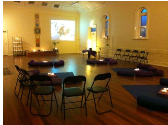
Main Hall set up for an event