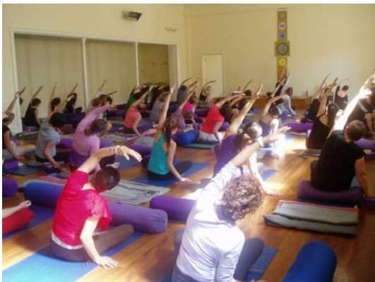
Full class in Main Hall